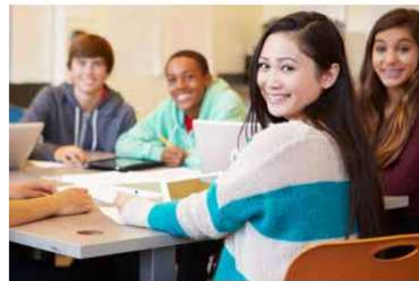
Options at 18