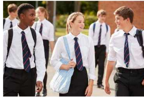
Choosing subjects in Year 8 and 9