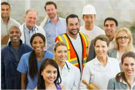
Getting a Job