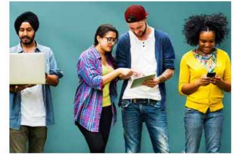
Choosing subjects and courses at 18