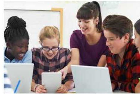
Choosing subjects and courses at 16