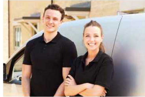
Getting into Self-employment