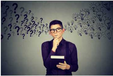
How to choose the right subject or course