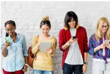
Options at 16